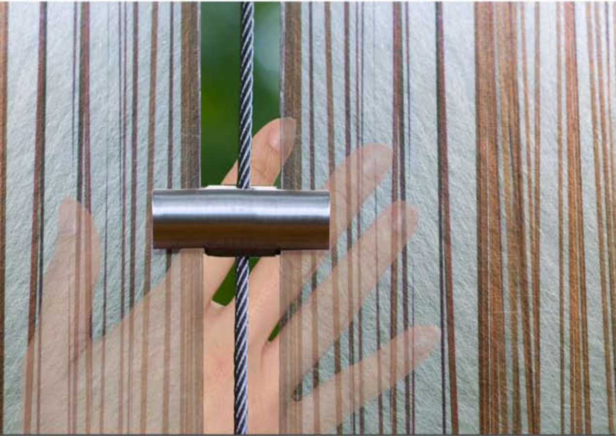
Autumn Grass Translucent Panel